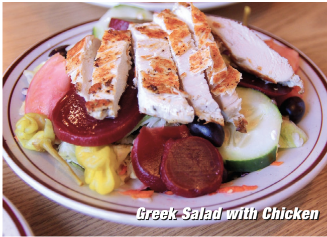
Greek Salad with Chicken