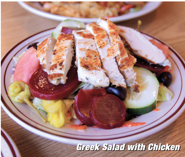
Greek Salad with Chicken

Chicken Plate . . . . . 12.59 Grilled chicken with coleslaw, hard boiled egg, cottage cheese, and cucumber, tomato, and beets garnish. Served with pita.